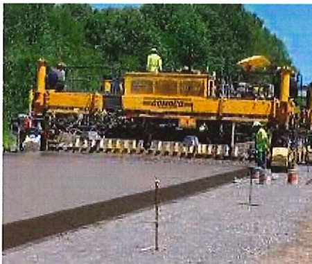
Streets will be constructed by slip-form paving equipment.

The construction is anticipated to last 2 weeks, weather permitting.